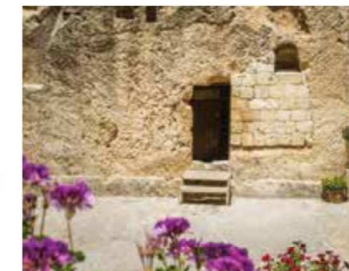
The Garden Tomb in Jerusalem

2 Pray for the 700,000 people in Britain who have autism y a lifelong, developmental disability that affects how they communicate and relate to others and their experience of the world around them y to be better understood, supported and championed to thrive, from childhood into the rest of their lives.